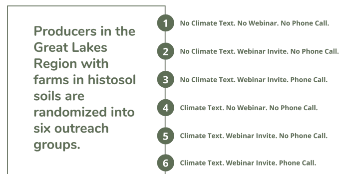
Fig. 1 Experimental Design

To track responses, each message group had their own website address and each webinar participant had to log in with their name. To track local office contacts, the team will analyze USDA's Receipt for Service database. Because the outreach approaches were